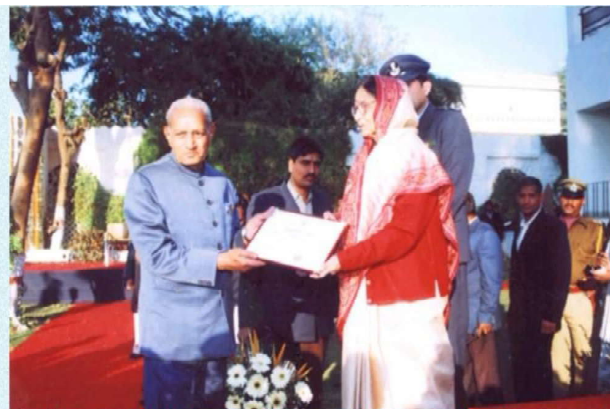
Honoured with "Best State-Level Organization" by the Governor of Rajasthan, Mr. Prathibha Patil & Chief Minister, Mrs. Vasundhara Raje Sindhiya on 26 th January 2007