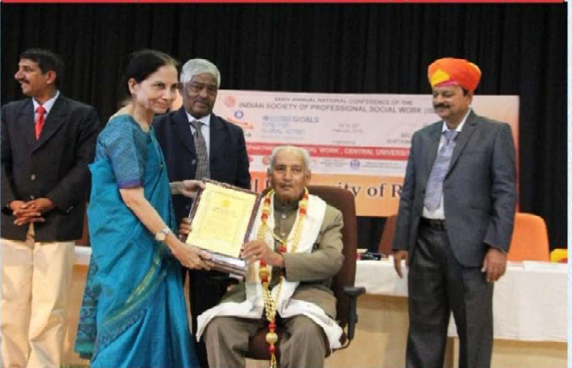
Honoured on 34 th National Conference of Professional Social Work organised by Central University of Rajasthan (CURAJ) on 24 th February 2016.