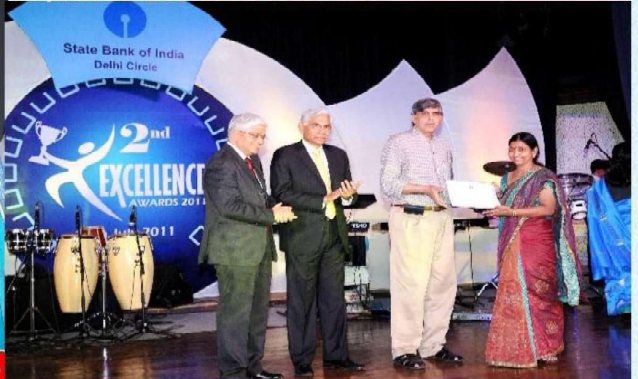
Awarded SBI Excellency in New Delhi on 30 th May, 2011