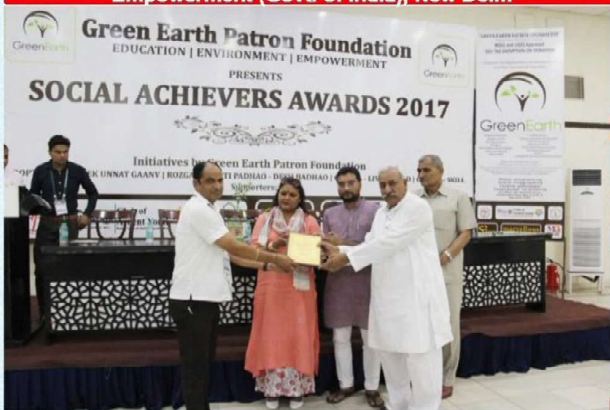
On 14 th July 2017, Social Achievers Award-2017 from G.I.P. Foundation at New Delhi.