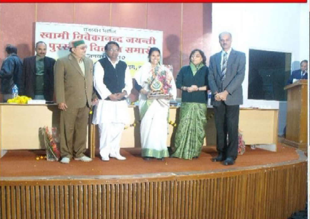
State-Level Best Organisation working In the field of Mental Retardation on 3 rd December, 2009