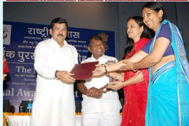
National Award for Almer Local Level Committee given by Mr. Mukul Wasnik, Centre Minister of Social Justice and Empowerment (Govt. of India), New Delhi