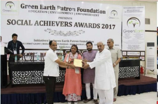
On 14<sup>th</sup> July 2017, Social Achievers Award-2017 from G.I.P. Foundation at New Delhi.