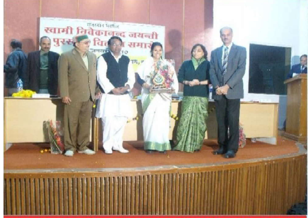
State-Level Best Organisation working in the field of Mental Retardation on 3rd December, 2009