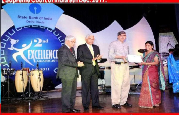
Awarded SBI Excellency in New Delhi on 30th May, 2011