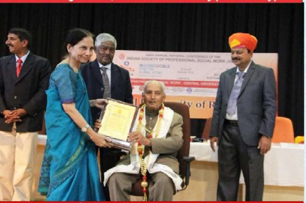
Honoured on 34<sup>th</sup> National Conference of Professional Social Work organised by Central University of Rajasthan (CURAJ) on 24<sup>th</sup> February 2016.