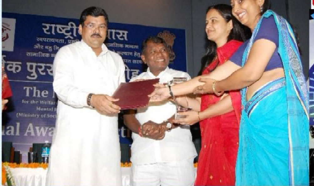
National Award for Almer Local Level Committee given by Mr. Mukul Wasnik, Centre Minister of Social Justice and Empowerment (Govt. of India), New Delhi