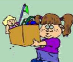
खिलौनों को हटाना