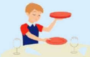
मेज को व्यवस्थित करना