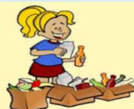
कचरे का अलग करना