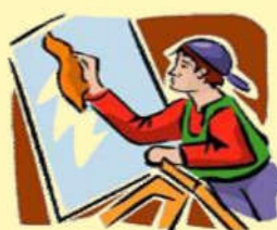
खिड़कियां साफ करना