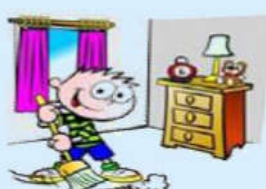
बेडरूम की सफाई करना