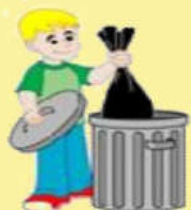
कचरा पेटी से कचरा बाहर निकाले